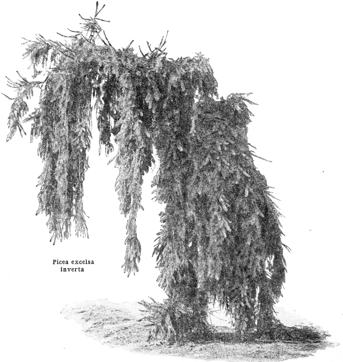
Picea excelsa inverta

The fine specimen of Picea excelsa inverta represented in the above cut is about 13 feet high and 10 feet broad. It is a thrifty plant in good condition, was transplanted in 1900, and has a fine mass of fibrous roots which retain a heavy ball of earth. It will be carefully dug and the roots mossed and the top protected with crate or burlaps and loaded on car for $75.